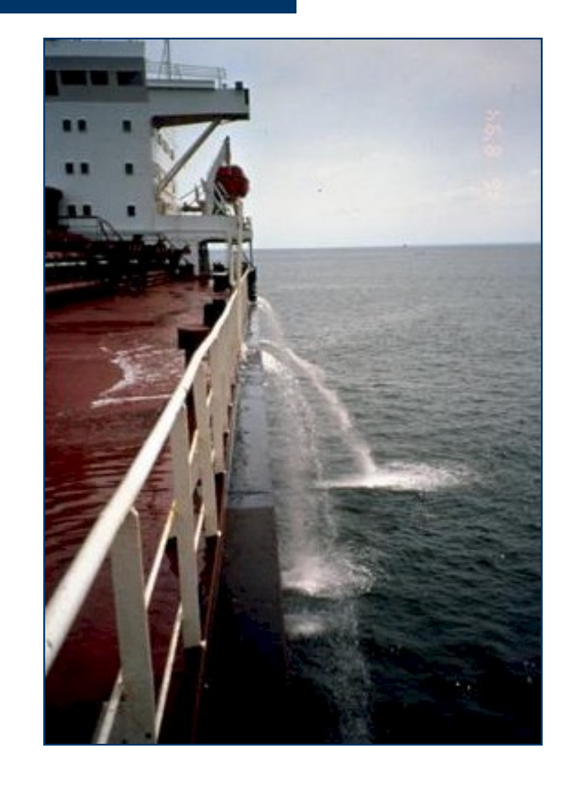
Ship exchanging BW

Reduces the number of potentially invasive species in the ballast tanks